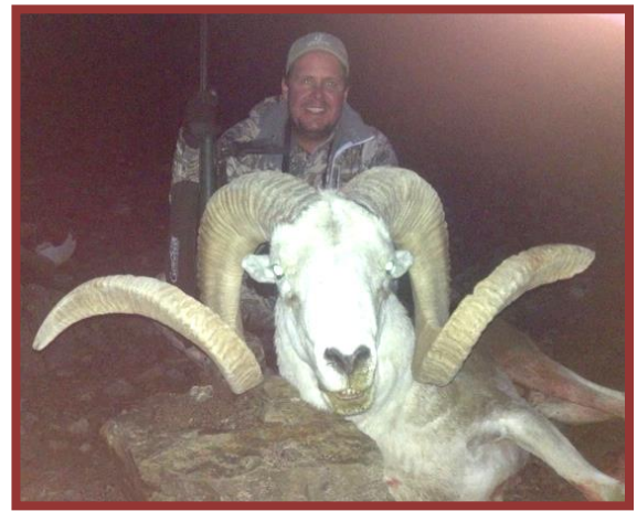
Two Great Marco Polo Trophies