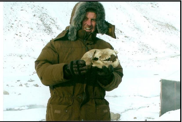
Pamir Bear Skull