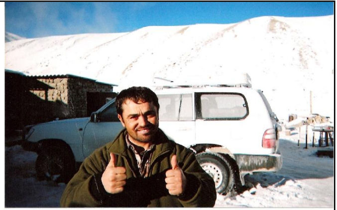
Guide With Thumbs Up-All Hunters Were Successful!

We recommend RIPCORD for your Rescue Travel Insurance. They provide a one-stop integrated travel protection program for adventurers and 24/7 contact with medical and security professionals. They are a medical and travel security risk company that provides worldwide evacuation and rescue services from your point of emergency all the way home. www.ripcordrescuetravelinsurance.com/portal/highmtnhunts