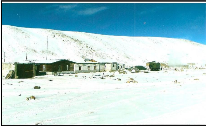
Murgab Hot Spring Camp